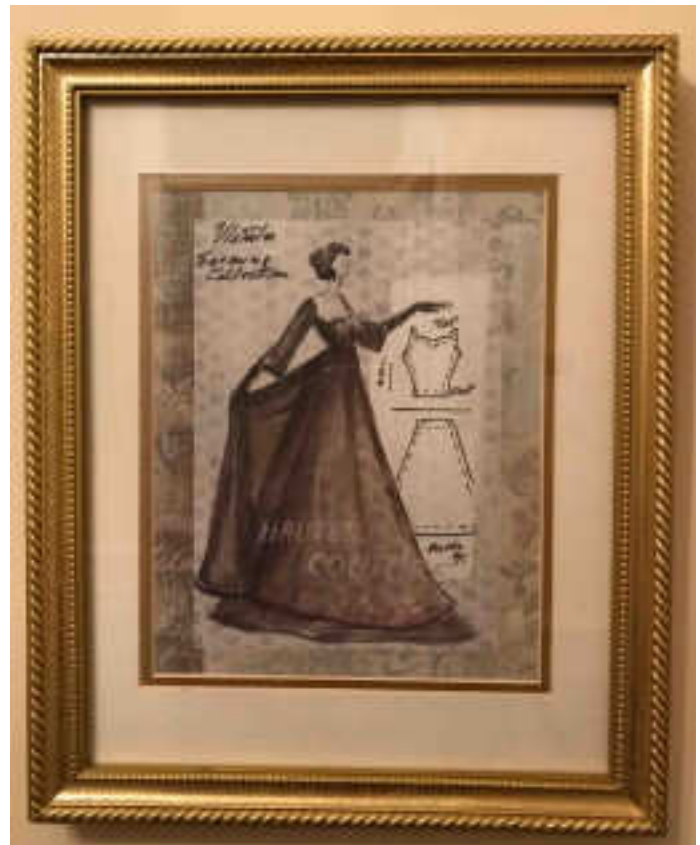
Original watercolor, from NYC designer's salon, "Winter Evening Collection," signed and professionally framed with matte, 12x15