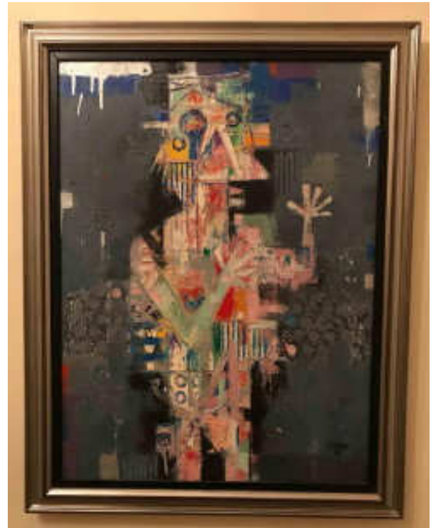
"The Entertainer" by NYC Artist, Donald Pierce. Original oil on canvas, professional framed, 18x24