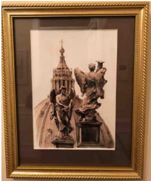
A signed watercolor by Celia, from Italy 12x 15, professionally framed and matted